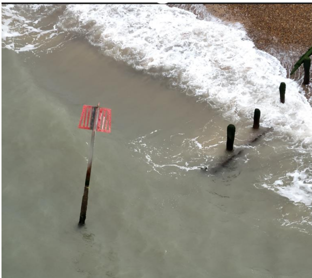
Image: Defected marker to be repaired

We will be straightening and re-painting two damaged navigation markers.